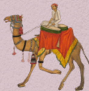
Table mats, runners and table covers crafted in the airy cotton cambric, chambray and latha fabrics, adorned with hand embroidered appliqué art, ranging from INR 250 to 1,400.